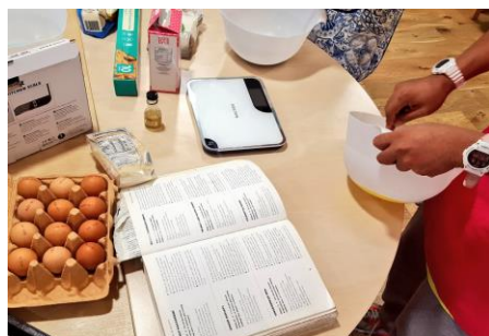
Photo of our resident (Ian) baking a cake one coffee morning. It was yummy!

Come and join us for FREE coffee, tea and cake on Wednesday mornings! We are a friendly group of local neighbours and everyone is welcome. We also do creative activities, games, bake cakes and quizzes.