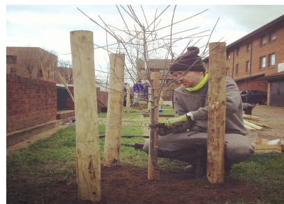
Tree Planting in Elmington Road

The 25 trees include different varieties of apple, pear, cherry, plum, damson, quince and green gage. They are already two years old and have been grafted onto special rootstock to ensure they will not grow too big when they have matured – so that everybody can access the fruit! Later this summer, the first few fruits will appear on the trees, but it will be summer 2019 before we see the first full crop produced. Once this happens, residents can pick and use the fruit as they wish.