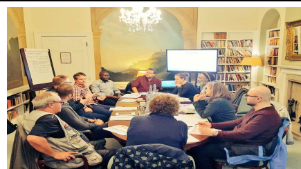
TMO Board Members Away Day (Nov 2017)

The improvement plans the TMO wishes to carry out in 2018/2019 will be: